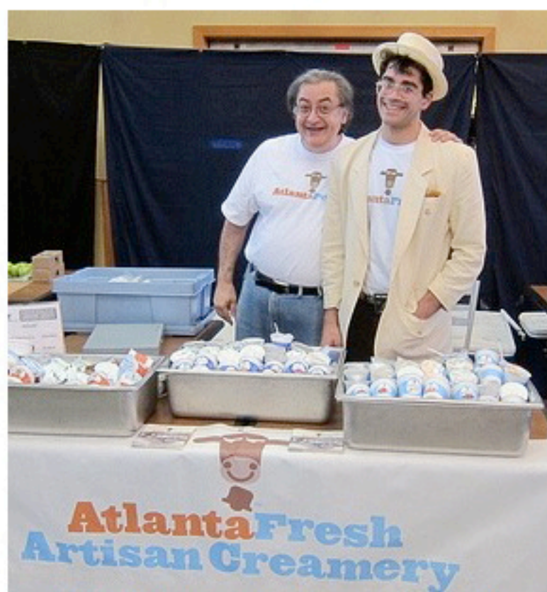
How could you not buy yogurt from these two guys?

AtlantaFresh products are now available in the dairy section of Whole Foods in Green Hills and Franklin or via their website. They cost a little bit more than most other yogurts, but for fresh regional ingredients, they are definitely worth checking out.